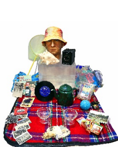
At The Seaside